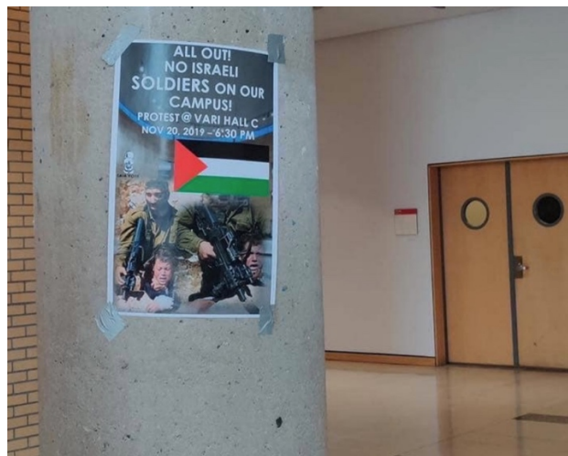
[SAIA Disruption poster posted in York's Vari Hall]