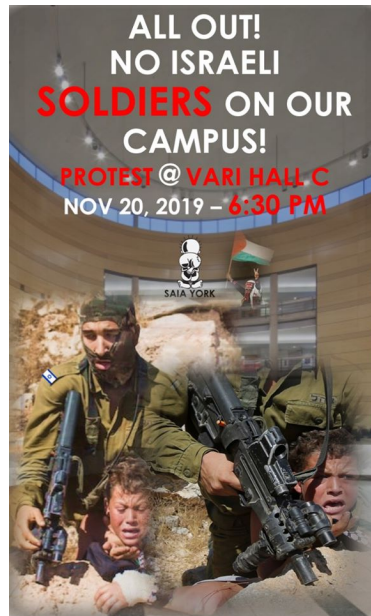
[SAIA Disruption poster]