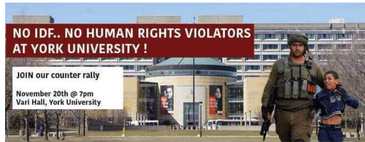
[SAIA Facebook event image purporting to show an armed Israeli soldier claspng a child on York campus]

Keele campus, protest the Herut Event by means of a “counter rally”, and “[t]ell York University that we will not tolerate war criminals on our [campus]” (the “SAIA Disruption”):